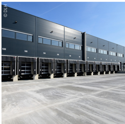
Industrial Campus Vienna East | 2431 Enzersdorf a. d. Fischa