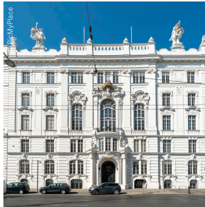
Ensemble Schwarzenbergplatz | 1040 Vienna