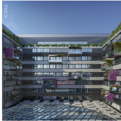
myhive am Wienerberg URBAN GARDEN | 1100 Vienna