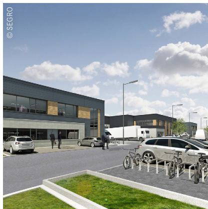
SEGRO Business Park | 1230 Vienna