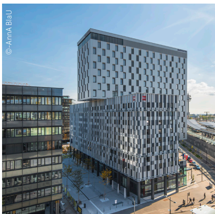
QBC 5 Hotels IBIS & NOVOTEL | 1100 Vienna