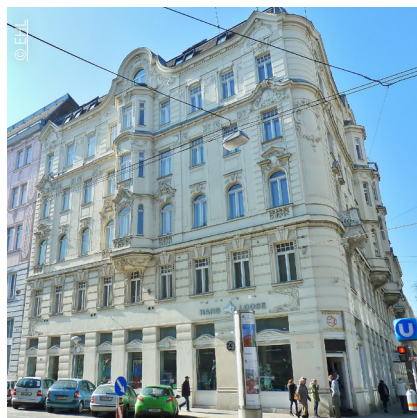
Zinshaus | 1040 Vienna