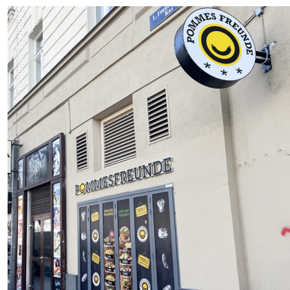
Pommes Freunde | 1010 Vienna