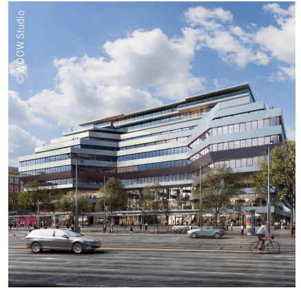
FRANCIS | 1090 Vienna