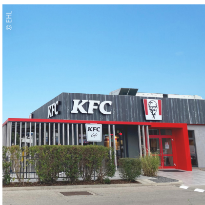
KFC | 2345 Brunn am Gebirge