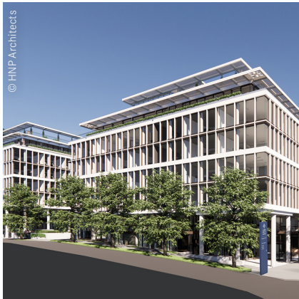
Carré Muthgasse | 1190 Vienna