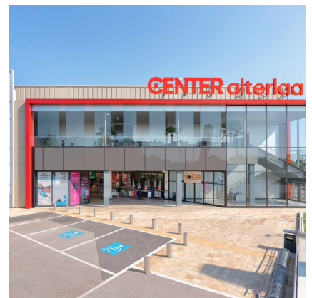
Center Alterlaa | 1230 Vienna