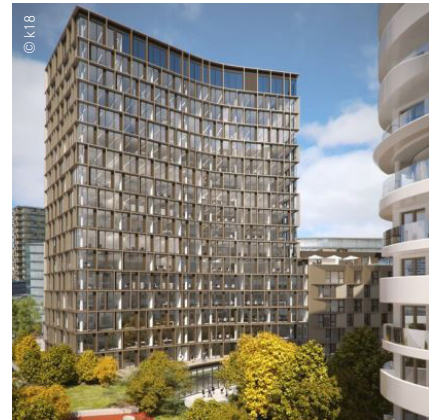
Canetti Tower | 1100 Vienna