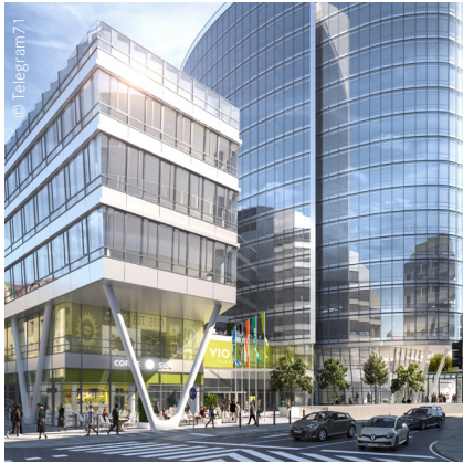
VIO PLAZA | 1120 Vienna