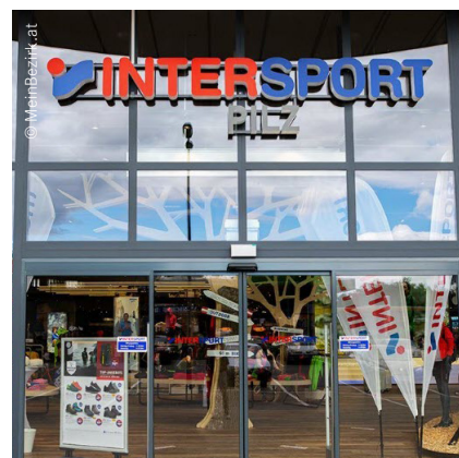
INTERSPORT Pils | 9020 Klagenfurt