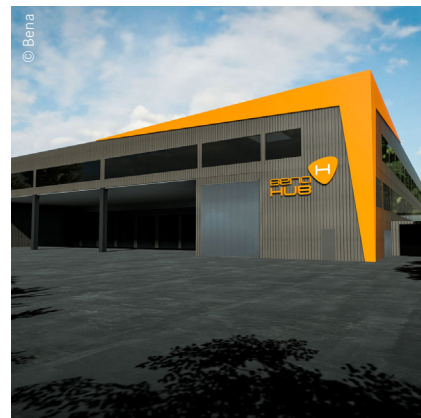
BenaHUB | IZ NÖ Süd, 2351 Wr. Neudorf