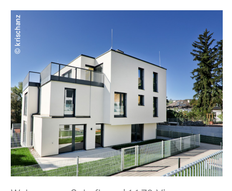
Wohnen am Schafberg | 1170 Vienna