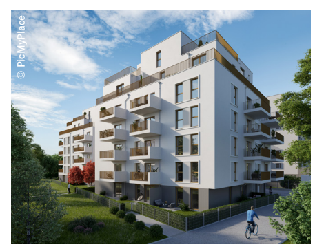
Viola Homes | 1100 Vienna