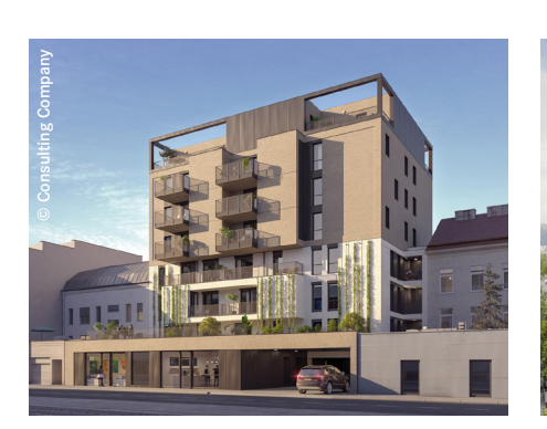
Erzherzog-Karl-Strasse 134a | 1220 Vienna Smart Stick | 8020 Graz