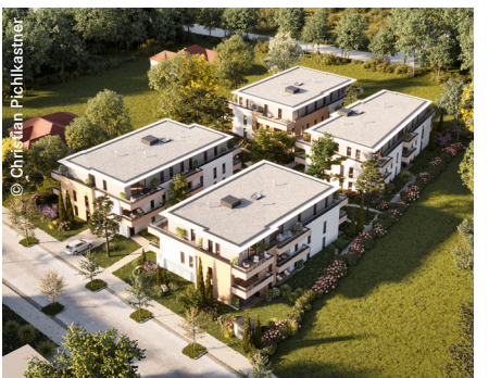
Bella Vita | 2700 Wiener Neustadt