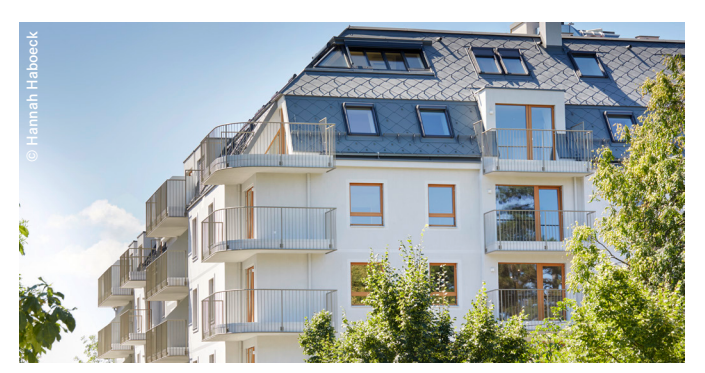
Park in Sicht | 1140 Vienna