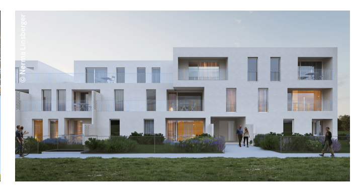
Flori Flats | 1210 Vienna