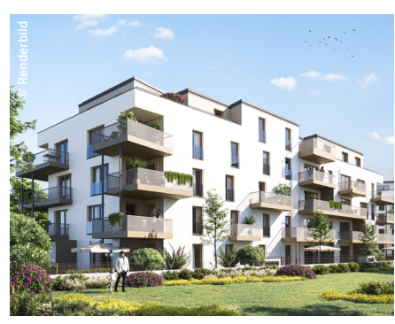
KOLL.home | 2700 Wiener Neustadt