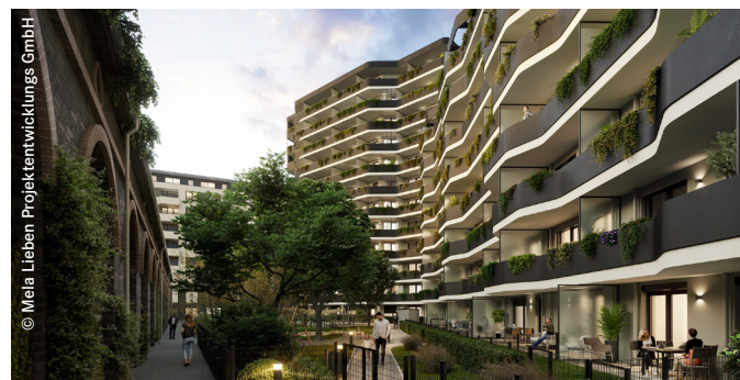
DECK ZEHN | 1100 Vienna