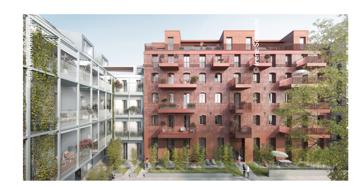
Apostelhof | 1030 Vienna